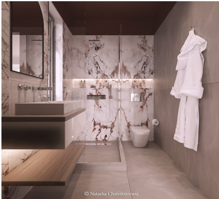
Photorealistic illustration of Master Bedroom's bathroom © Natasha Chatziioannou

The fluent design and the specially made furniture serves both the functionality and the aesthetics of the space without obstructing the natural light.