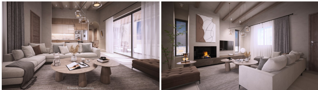
Photorealistic living room illustrations © Natasha Chatzioannou

The living room is facing the fireplace and parallel to the large opening overlooking the outside environment, the pool and the sea.