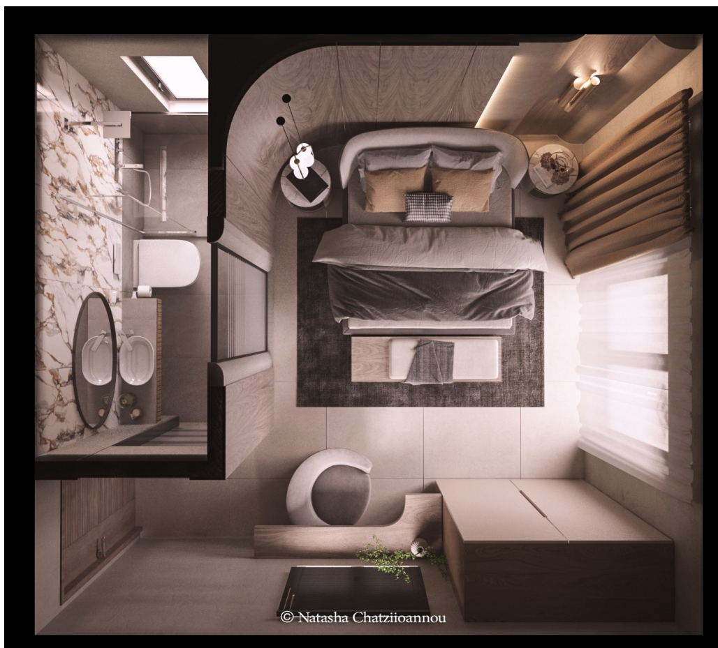
Perspective bedroom 2 floor plan © Natasha Chatzioannou