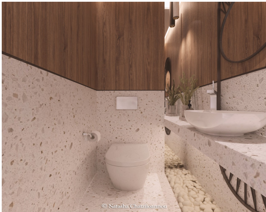
Photorealistic wc illustration © Natasha Chatziioannou

The color palette that was followed is in earth tones, with some colorful decorative touches, giving a playful note to the space.