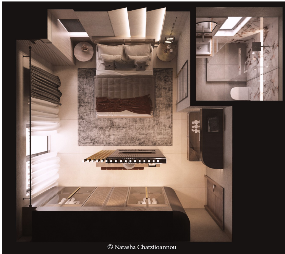
Perspective plan master bedroom © Natasha Chatziioannou

The fluent design and the specially made furniture serves both the functionality and the aesthetics of the space without obstructing the natural light.