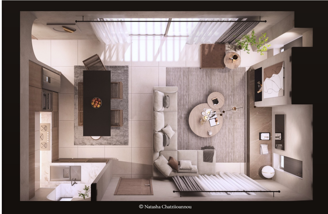
Perspective plan of the living room and kitchen © Natasha Chatzioannou