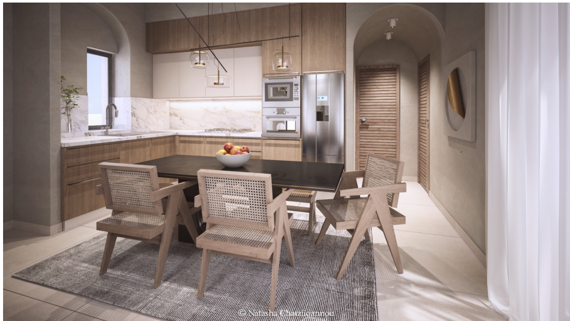
Photorealistic illustration of kitchen - dining room © Natasha Chatziioannou

Simple and clean design lines characterize this project, emphasizing the construction details, the aesthetics and the functionality of each house. The choice of materials was based on the creation of a familiar, user-friendly space, with elements of discreet luxury.