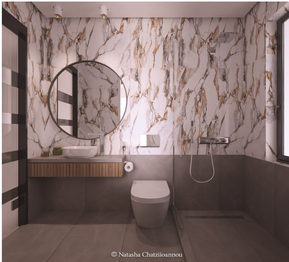
Photorealistic illustration of the bathroom 2 of the bedroom © Natasha Chatzioannou