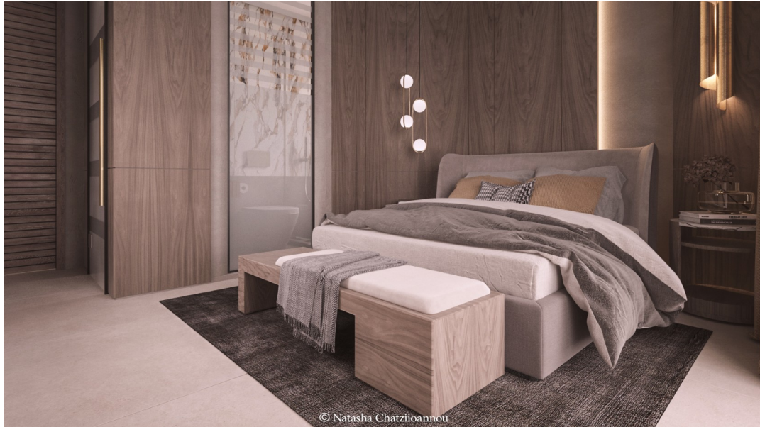
Photorealistic illustration of the bedroom 2 © Natasha Chatzioannou